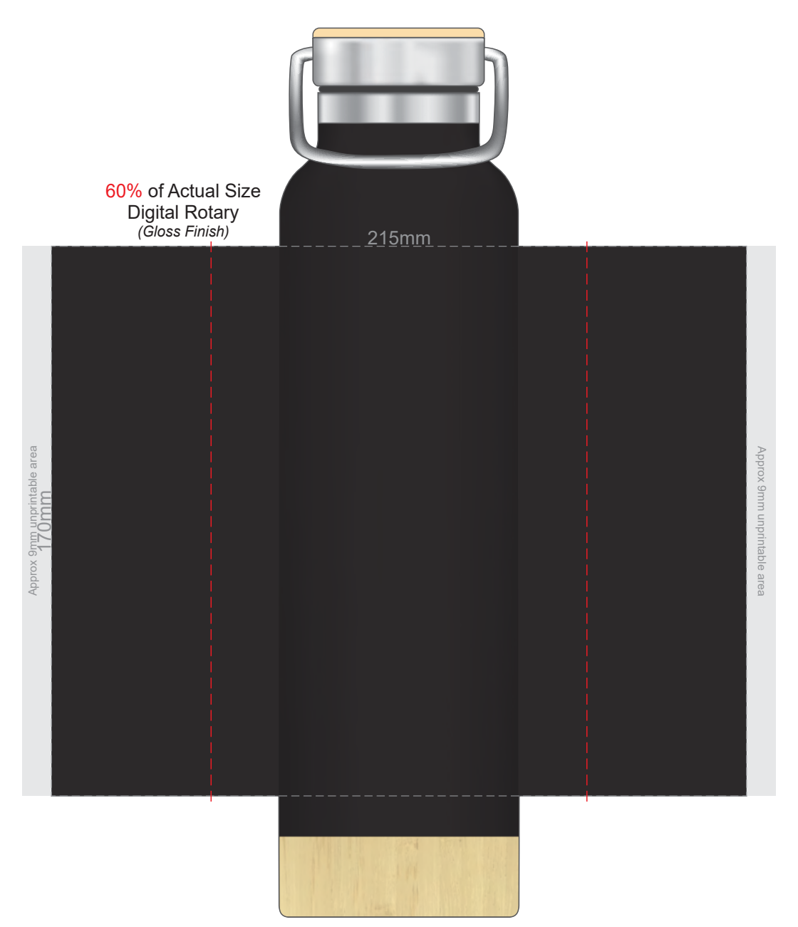
Red Line = Exact opposites of the product (centre artwork to the red line)